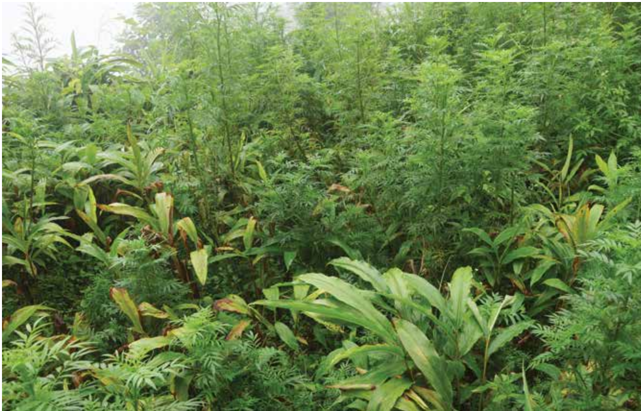
Marigold planted in the large cardamom plantation, a climate smart practice