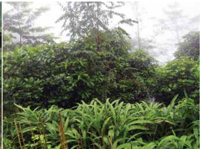
Initiate large cardamom plantation, intercrop with legumes, cereals etc. fruits etc.