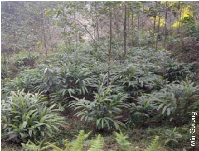
Plant suitable shade species.