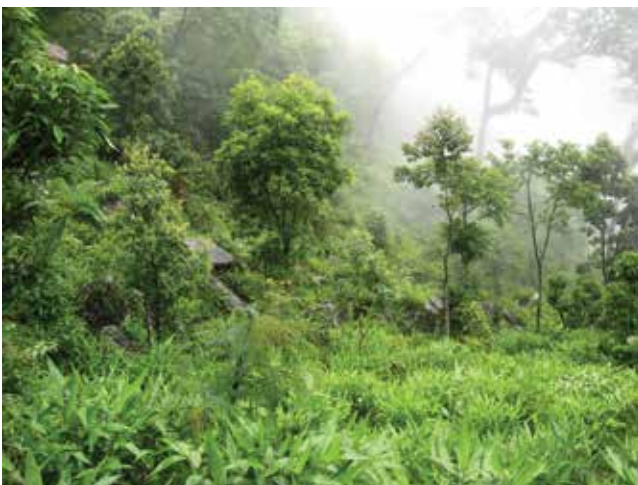
Grow seasonal crops such as maize, buckwheat, ginger millet, fruits, and beans, pulses or other legumes. Continue this for at least 2 years.