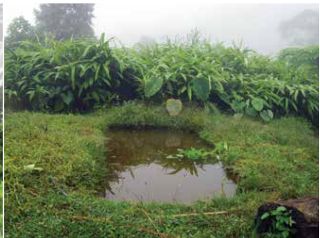
Establish proper irrigation facilities.