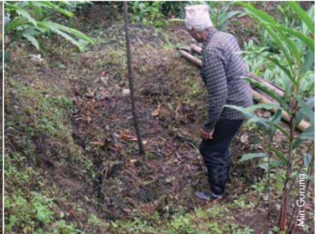
Make compost pits, and use weeds, litter, and slash biomass to make compost.