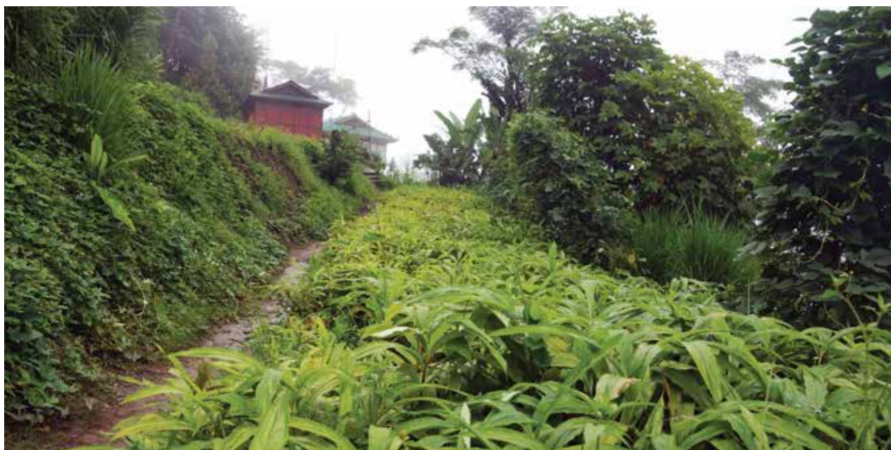
A large cardamom nursery in Hee-Gaon, West Sikkim