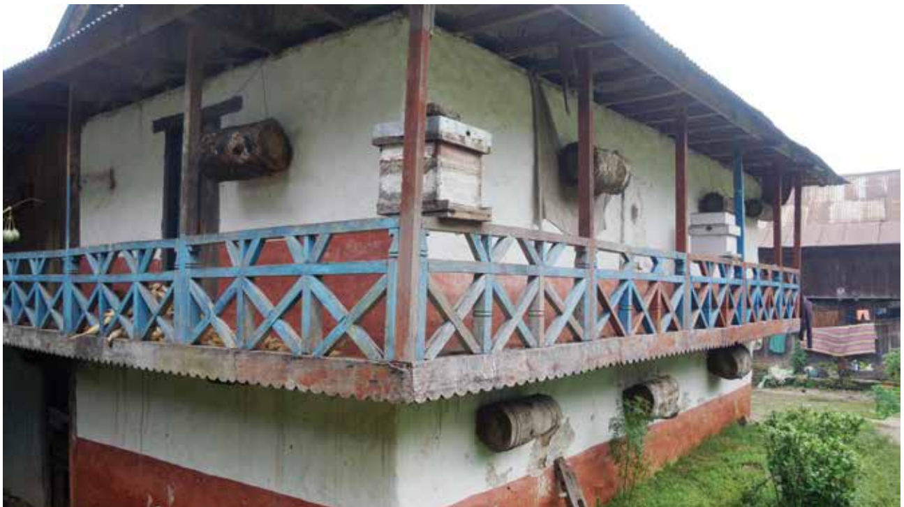
Beekeeping is a traditional practice in Furumbu VDC, Taplejung District