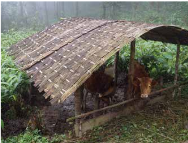
Keep cows, oxen, or buffaloes in the field to maintain fertile soil conditions.