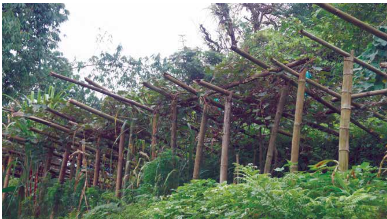
Kiwi cultivation at Udai Dahal's farm at Yaphrek, Phurumbu VDC 8