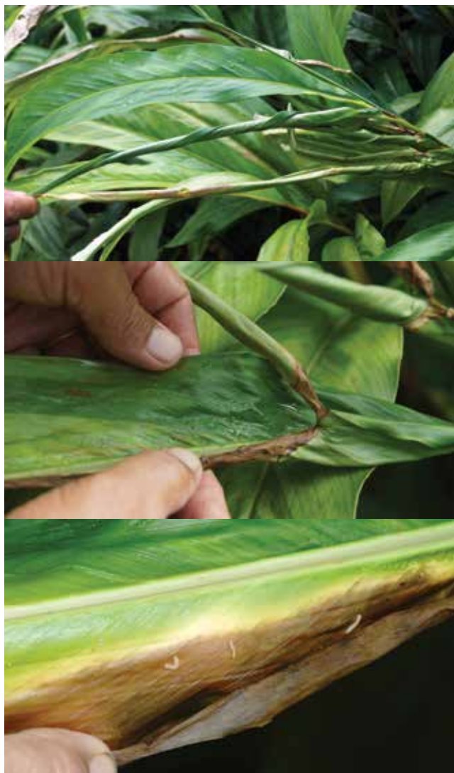
Illustrations for monitoring pests on large cardamom leaves